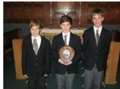
The victorious St Aubyns team