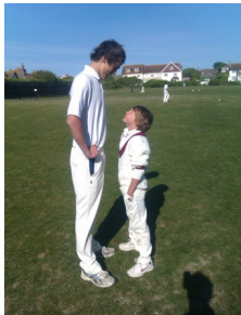
Perry sizes up the Shoreham opposition!!